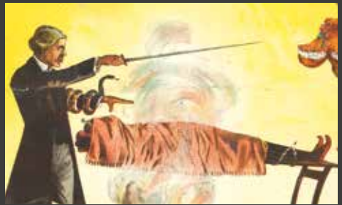
Images: City of London map (detail), 1666. Purple Heron by John James Audubon, 1827–38 Modern Witchery poster (detail), 1894.

Find out more and sign up at http://labs.bl.uk